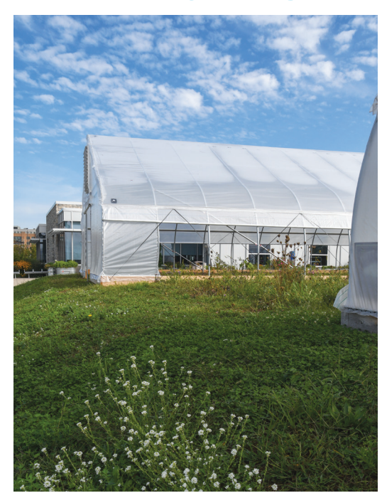
New Hoop House at the Food Innovation Center

Funding from Eaton Corporation, The Burdick-Thorne Foundation and H.P. Genevieve Connable Fund to Senior Services, Inc., is making this collaborative project possible.